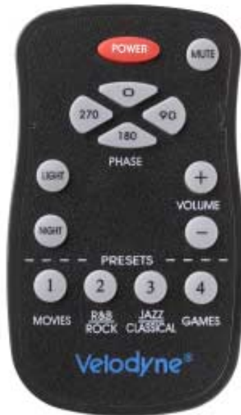
Figure 2. Remote Display

Figure 2 shows the remote control, enabling you to easily choose whatever listening mode you desire.